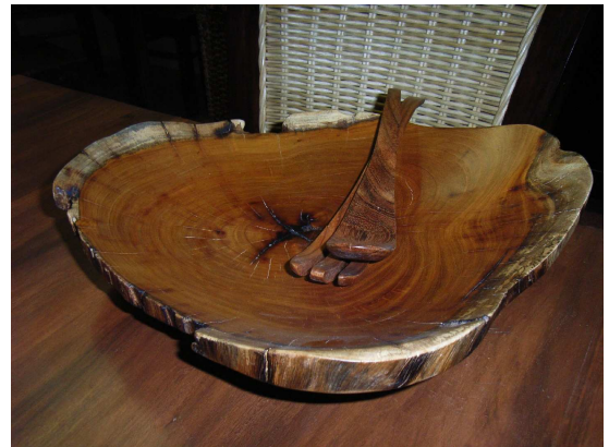
Costa Rican Root Platters and Bowls