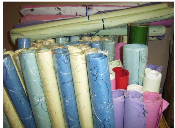
Recycled T-shirt Paper from India