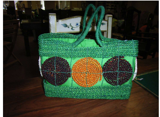
Bali Natural Fiber/Dye Handbag