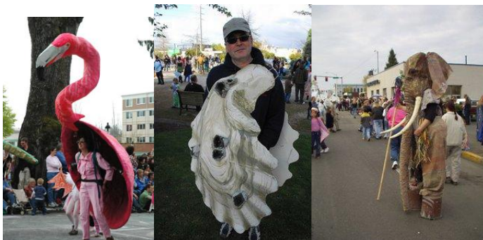
Photos of other Procession of the Species Parades in the world

Kitchener-Waterloo will host their first annual Procession of the Species Parade on April 24, 2010 . Procession of the species is a community arts-based Earth Day celebration where people flood the street to flaunt their favourite species or natural element whether it is flora, fauna or fungi, the sky is just the beginning! Seven Shores can't wait!!